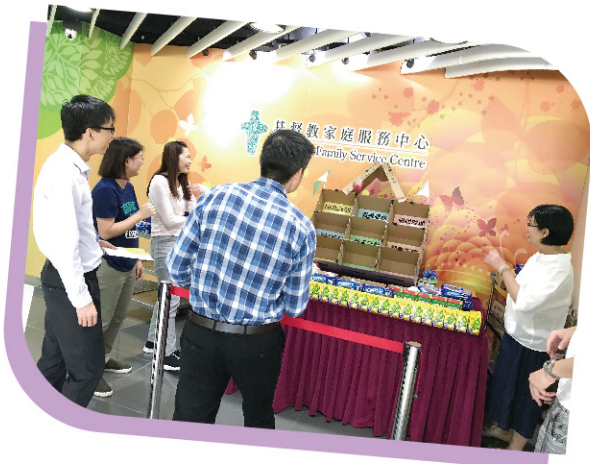
▲ 午間資訊站 Lunchtime Information Station

本會每年均會在週年大會頒發「長期服務獎」予緊守工作崗位多年的員工。本年度共有71位員工獲獎，當中包括10年獎33位、15年獎20位、20年獎15位、25年獎3位。