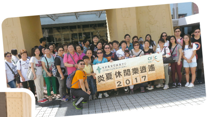
▲ 職員會舉辦的「炎夏休閒樂逍遙」 'Summer Local Tour' organised by Staff Association

As an acknowledgement for the commitment and diligence of our staff, a 'Long Service Award' is now presented at each Annual General Meeting to recognise our staff for their contributions to the Agency. Of the total 71 members of staff receiving the award last year, 33, 20, 15, and 3 were recognised for 10, 15, 20, and 25 years of service, respectively.