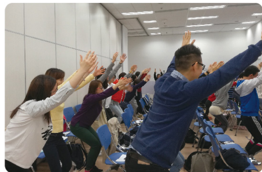
▲ 「Mindfulness Based Interventions for Mental Health」工作坊 'Mindfulness Based Interventions for Mental Health' workshop