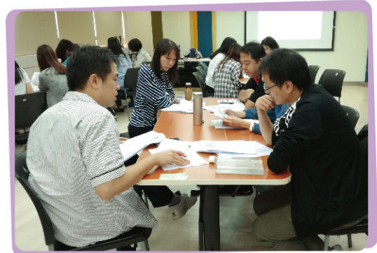
▲ 「Application of DISC in the Workplace」工作坊 'Application of DISC in the Workplace' workshop