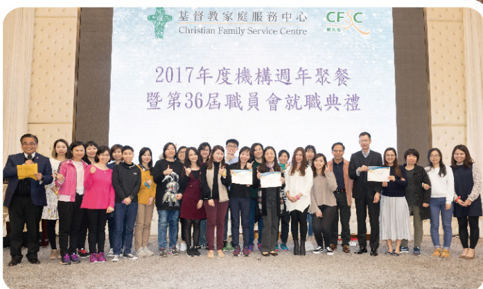
◀ 週年聚餐 Annual Dinner