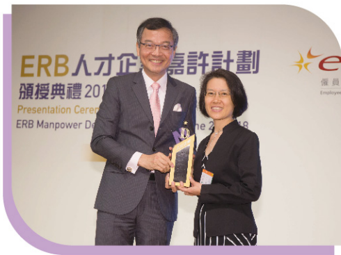
▲ 榮獲「人才企業」殊榮。 Recognised as 'Manpower Developers' by the Employees Retraining Board.