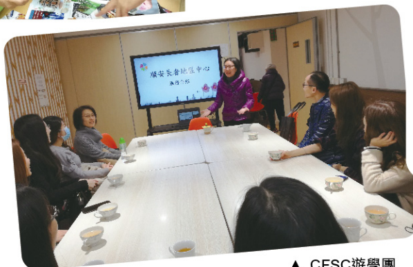
▲ CFSC 遊學團 CFSC Visit Tour